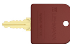
Dismounting key for locking systems 18000 and 19000 (independent on lock number)