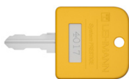
Dismounting key for locking system 4000 (independent on lock number)